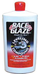
Polishing Compound (leaves no swirl marks)

Wipe with a clean cloth then apply this compound per label directions. Buff with a buffing wheel at 1,500 to 2,000 RPM. Leaves no swirl marks.