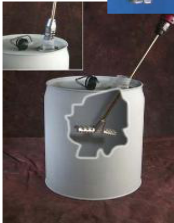
34005 Swing T Mixer