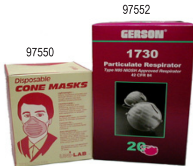
dual support elastic bands

Non-toxic, particle masks passes 50% less than comparable masks. Lightweight, comfortable and disposable.