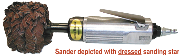
Sander depicted with dressed sanding star

Sanding stars must be dressed* first prior to use, in accordance with instructions supplied with the unit.