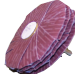
Sanding star ss supplied